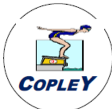
#22 F SWIM