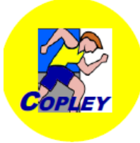
#18 M RUNNER