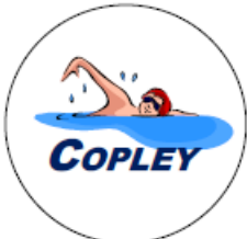
#21 M SWIM