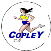
#17 F RUNNER